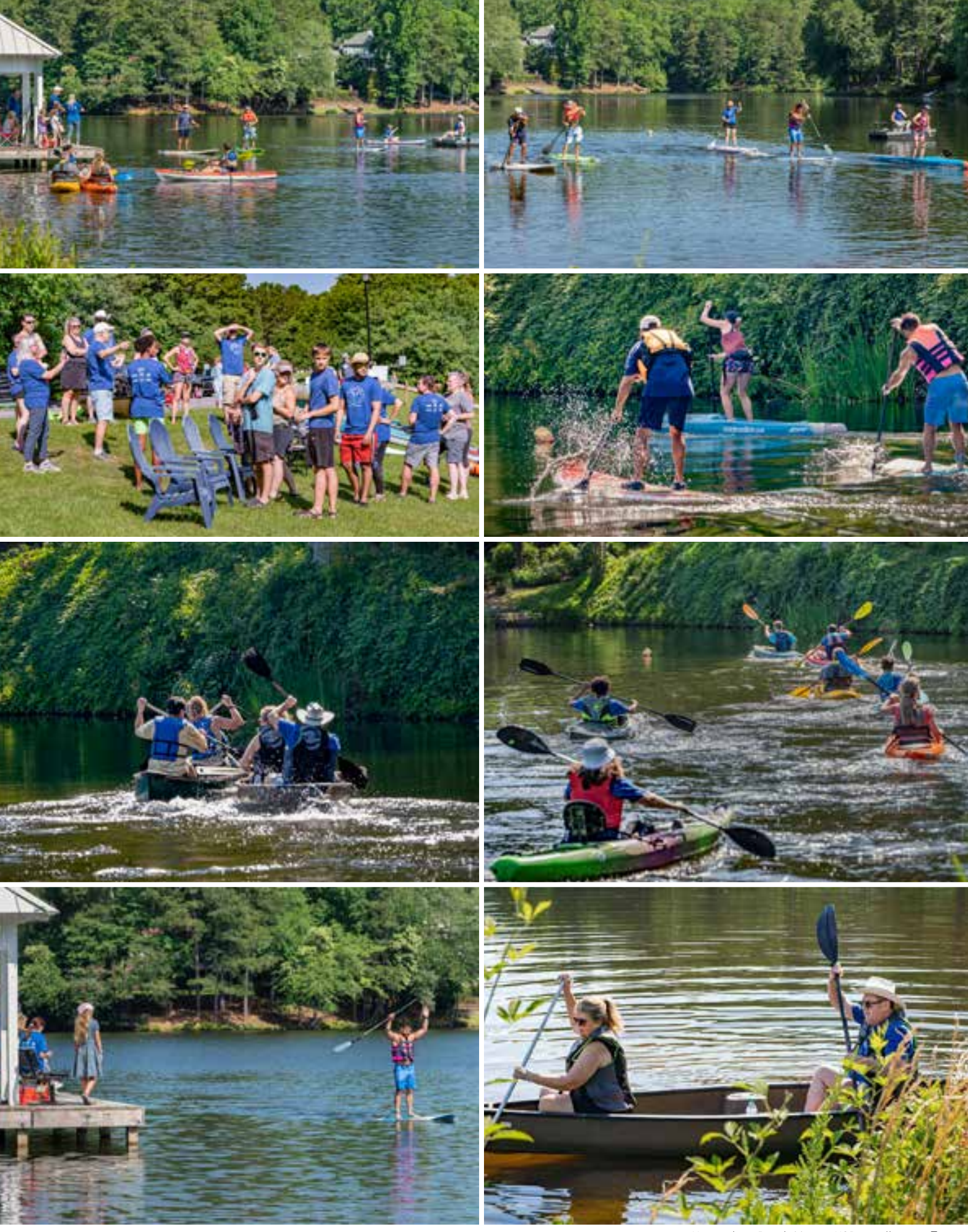
Horseshoe Bend // www.HSBroswell.com 5