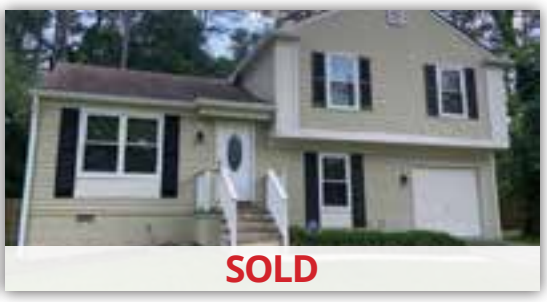
10275 Rillridge Court