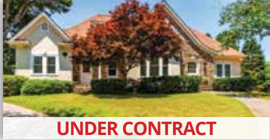
3060 Cabernet Court