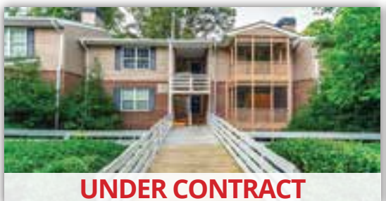
259 Quail Run