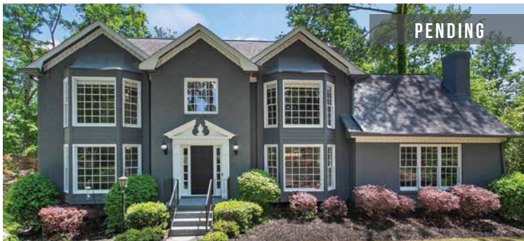
5045 ROXBURGH DR | COUNTRY CLUB OF ROSWELL ASKING $850,000