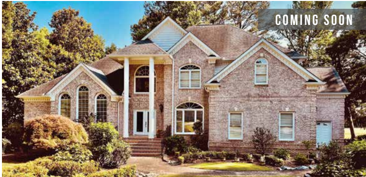
2680 ROXBURGH DR | COUNTRY CLUB OF ROSWELL ASKING $1,299,000