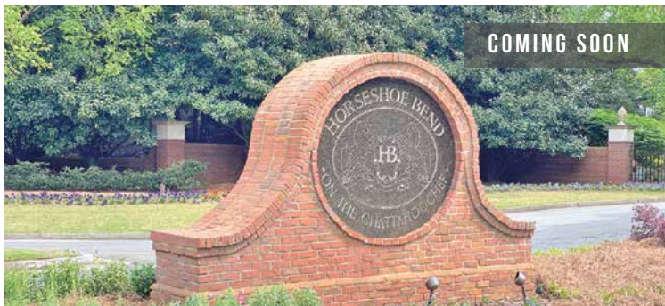
810 CLUB CHASE LN | HORSESHOE BEND ASKING $970,000

GET TOP DOLLAR FOR YOUR HOME #1 CENTENNIAL HS AGENT SINCE 2015