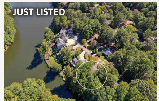
160 Boxelder Ln. - Lake Front